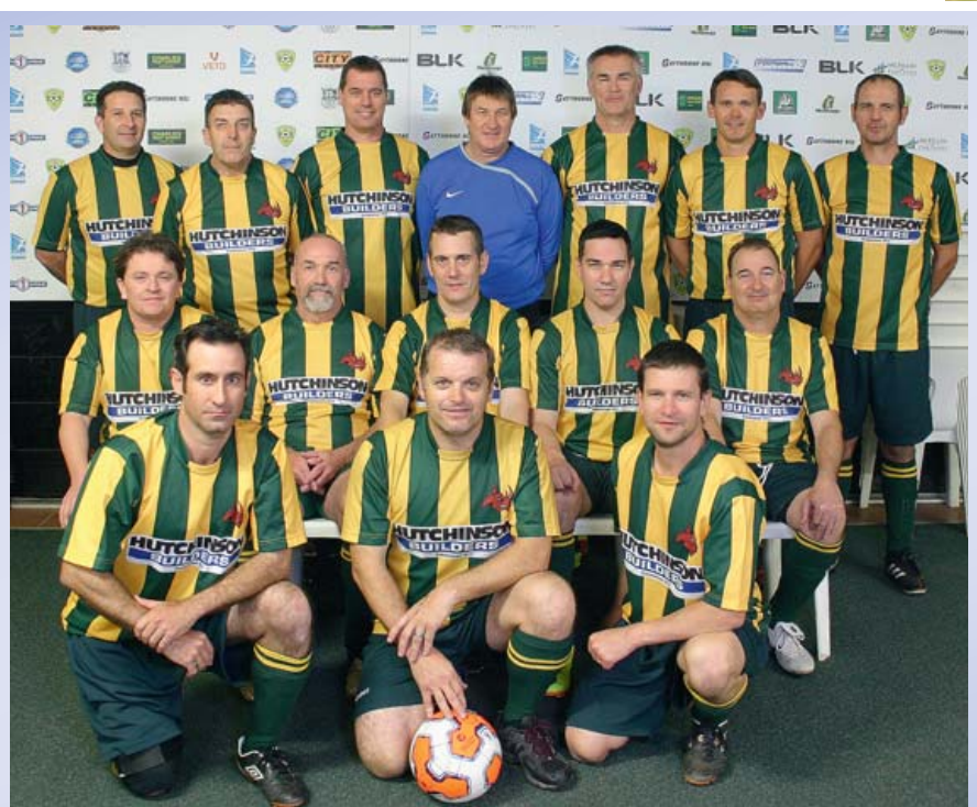
RHINO COUNTRY HUTCHIES has thrown its support behind the Mitchelton Rhinos – the Over 35 football team who are proud to wear their new uniforms. Members chose the name 'Rhinos' because they claim to be tough as rhinos and as thick-skinned!

A solid performance from the Hutchies' boys.