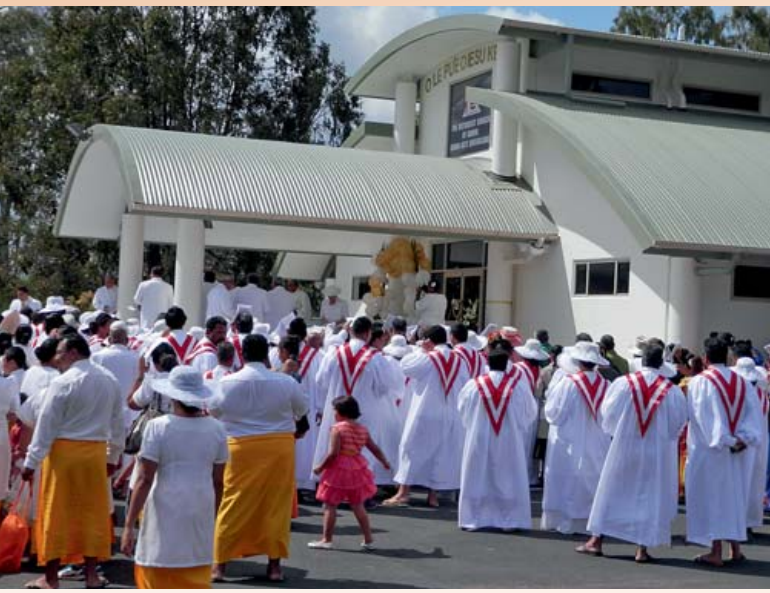
The official opening of the Logan Samoan Methodist Church was an inspiring experience, with 400 guests from all over the world rejoicing in the occasion.