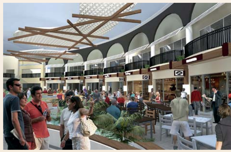
Artist's impression of the facade and shopfront upgrade to the central shopping and dining plaza of Chevron Renaissance in the heart of Surfers Paradise – one of Hutchies' smaller jobs on its varied workbook.

HUTCHIES has always done small jobs and bid open tenders – we follow the client rather than size or category of the project.