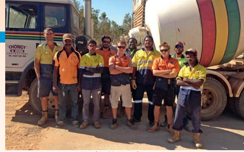
Hutchies' Doomadgee team.

These four indigenous trainees have since found employment