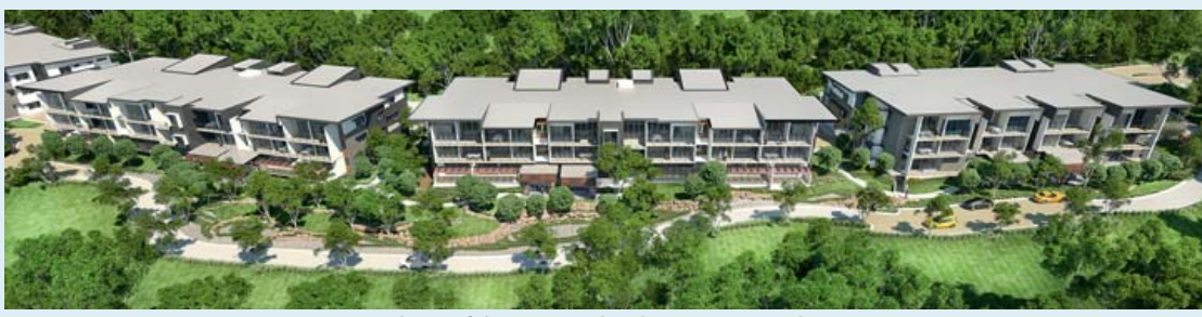
Stages one and two of the Canopy development are under construction.

Job Description: This project is located within the busy retail and restaurant area of South Bank Brishane