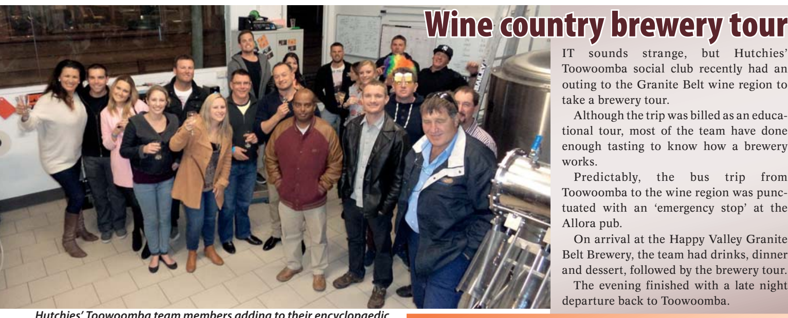
Hutchies' Toowoomba team members adding to their encyclopaedic knowledge of beer.

IT sounds strange, but Hutchies' Toowoomba social club recently had an outing to the Granite Belt wine region to take a brewery tour.