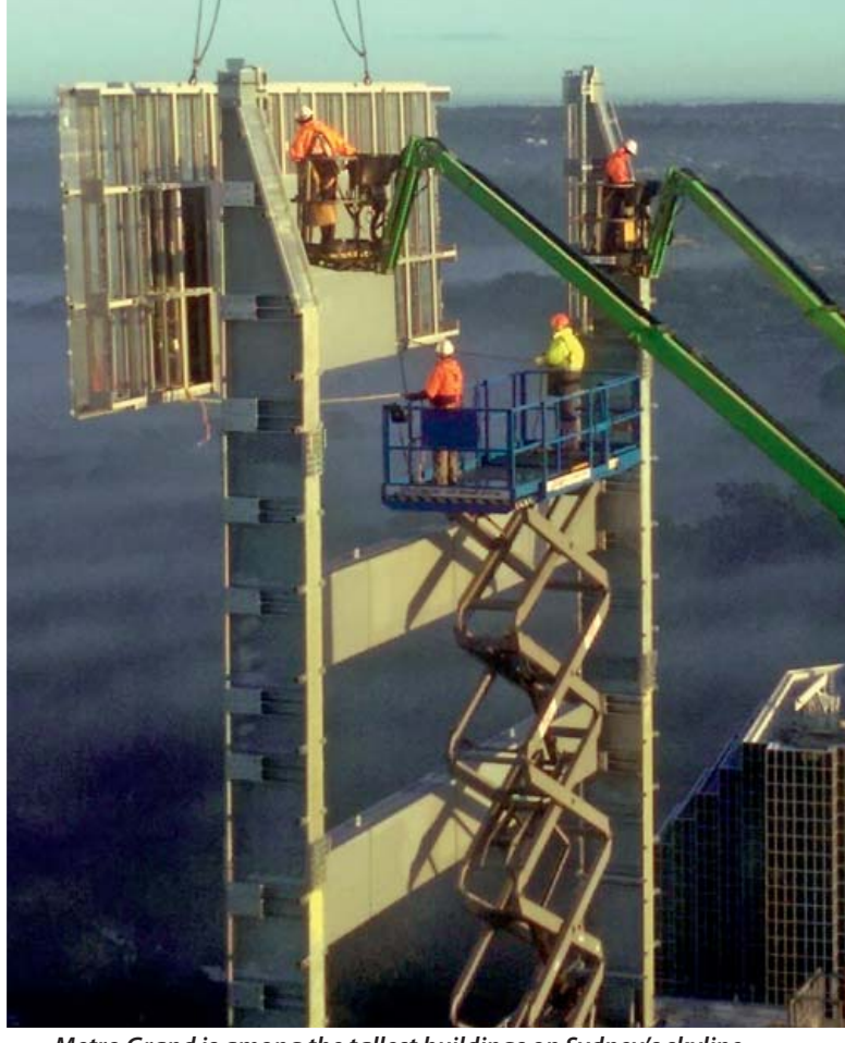
Metro Grand is among the tallest buildings on Sydney's skyline.