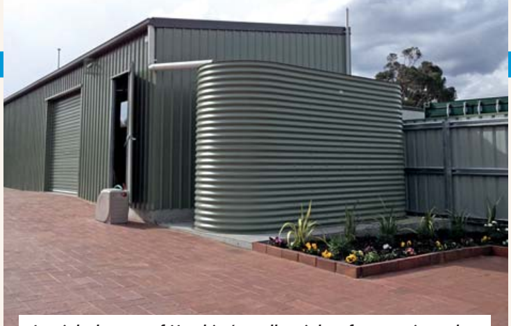
It might be one of Hutchies' smallest jobs of recent times, but the Tassie team is proud of the newly completed maintenance shed and storage facility at the Office of Australian War Graves Garden of Remembrance in Hobart.

"We are now considered 'locals' on a national scale because our team members and their fami-