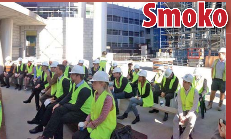
Guests attending Hutchies' first Smoko.

HUTCHIES has introduced a new form of 'smoko' to allow outsiders to visit live construction sites and learn more about the construction process.