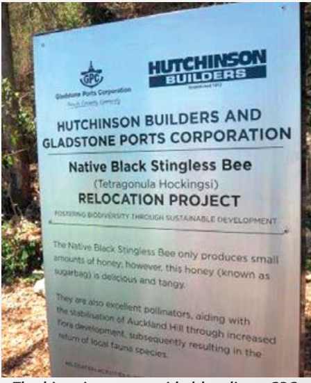
The hive signage provided by client, GPC, will ensure Hutchies' environmental stance and love of bees has a long legacy in the Gladstone community.

This hive will assist in the stabilisation of Auckland Hill through increased flora development